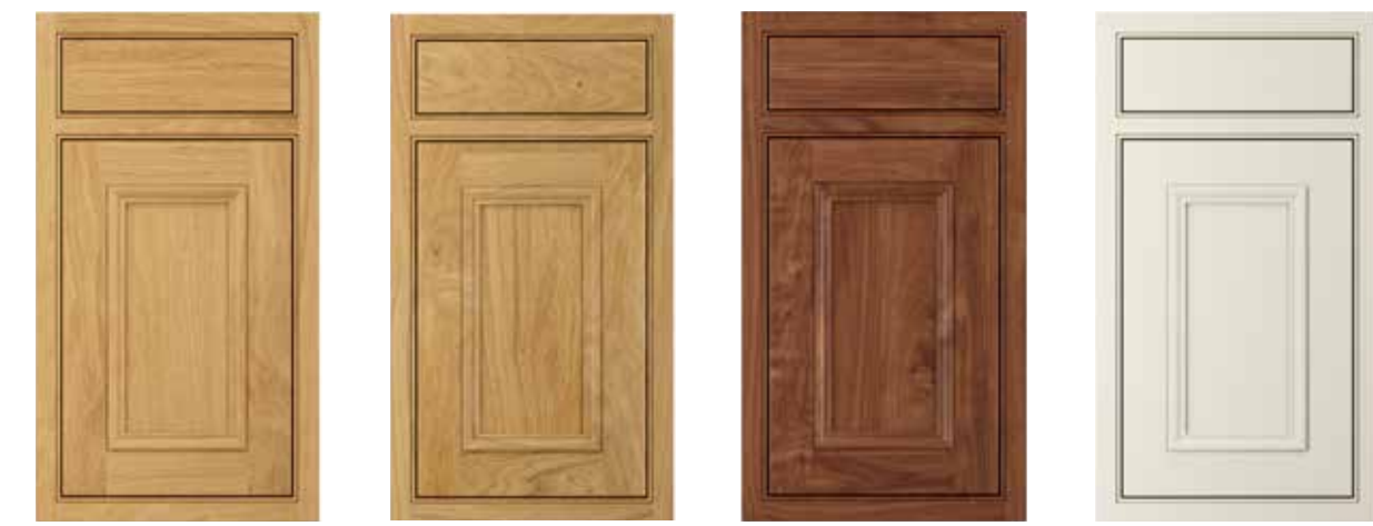
WHITE OAK CHARACTER OAK WALNUT PAINTED MUSSEL