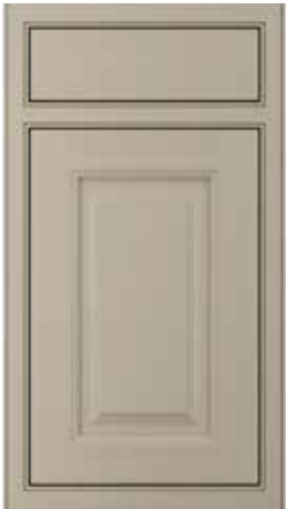
PAINTED STONE GREY