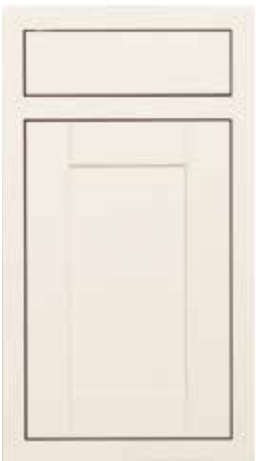
PAINTED WHITE COTTON