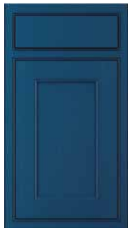
PAINTED PARISIAN BLUE