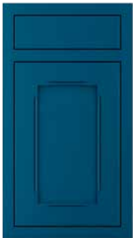
PAINTED PARISIAN BLUE