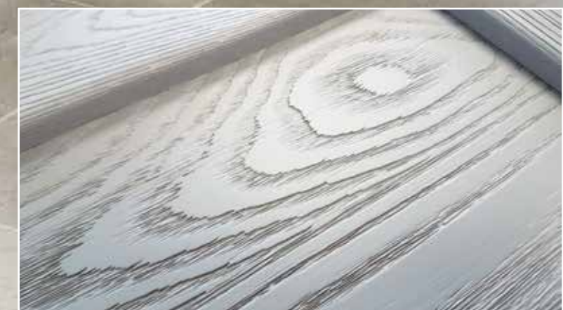
Deep grain detail on painted, sandblasted ash