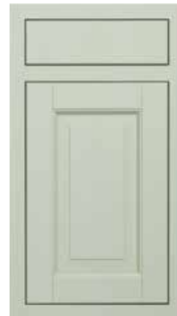
PAINTED SAGE GREEN