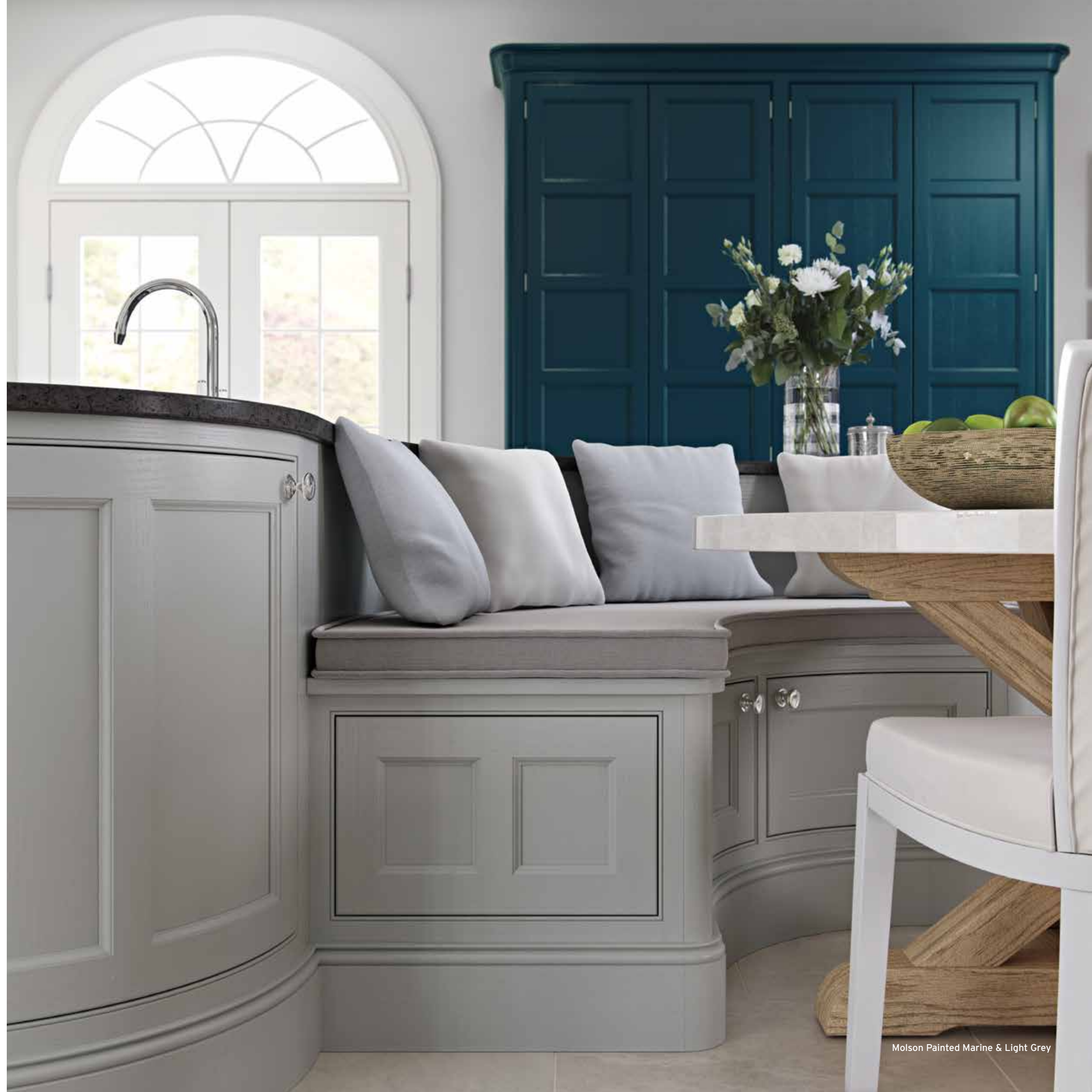
Molson Painted Marine & Light Grey

Here we showcase just a sample of what can be achieved in your home, allowing your imagination do the rest. Our desire is to create what you want without compromise, making your dream home a reality.