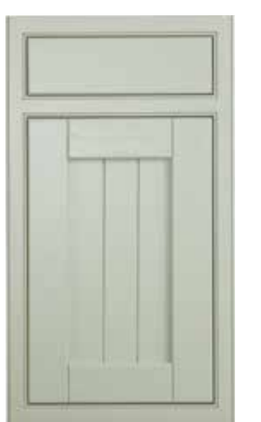
PAINTED SAGE GREEN