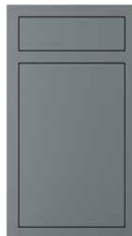
PAINTED DUST GREY