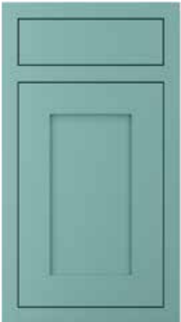
PAINTED LIGHT TEAL