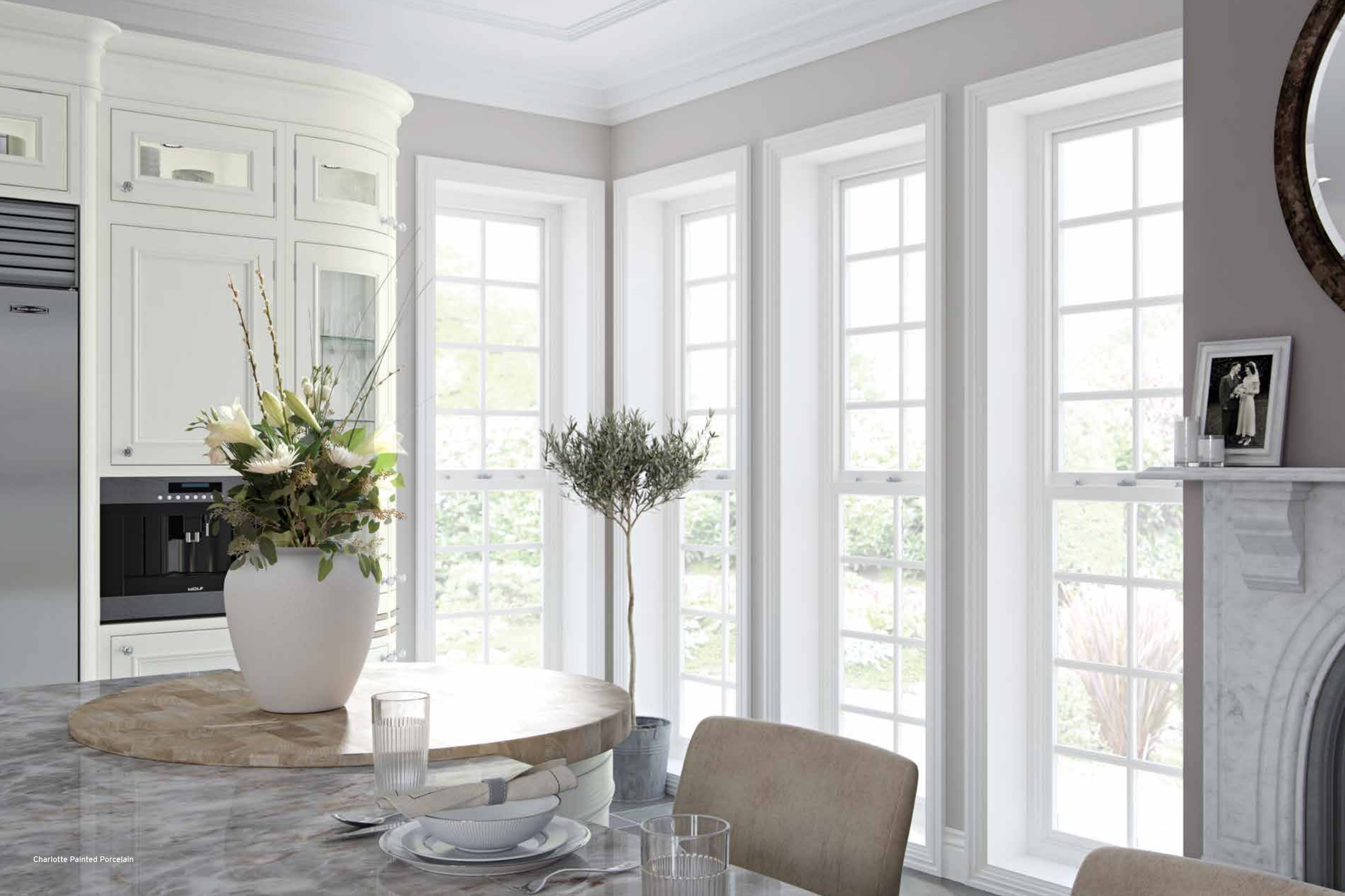
Charlotte Painted Porcelain