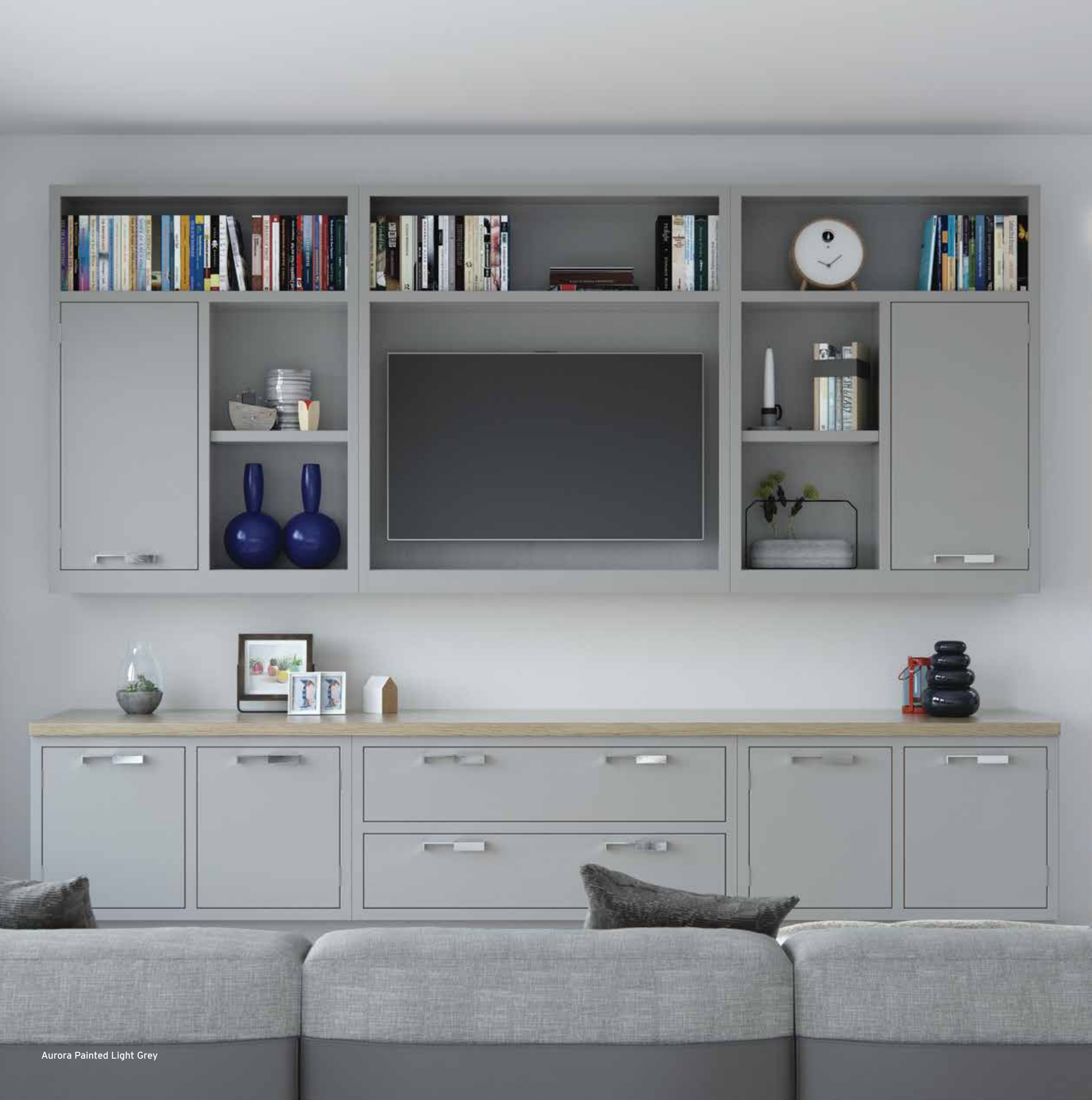
Aurora Painted Light Grey