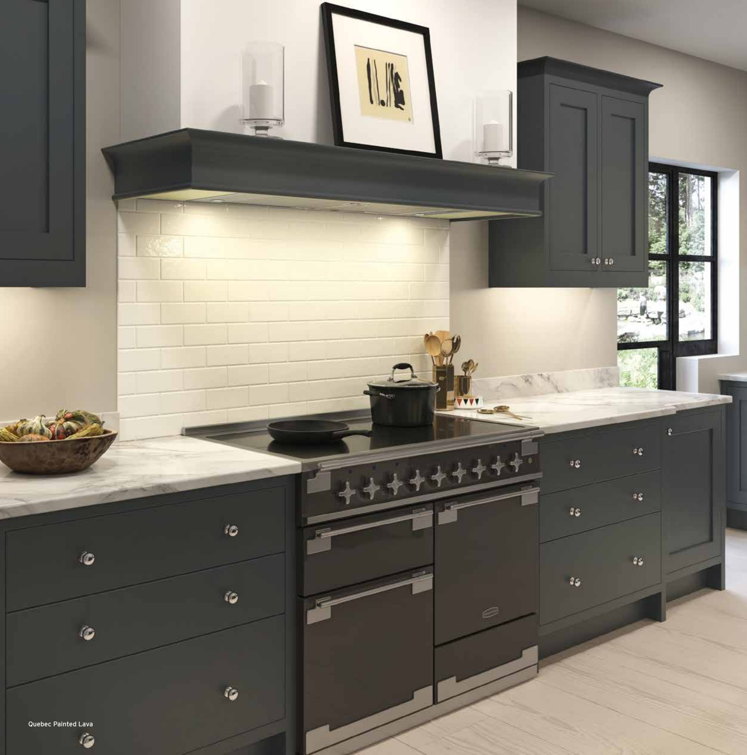
Quebec Painted Lava