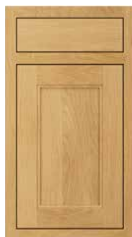
WHITE OAK ANTIQUED

The kitchen shown here features Sutton Painted Shell (wall units, barrel unit, overmantle), Graphite (base units, units above fridge freezer, island) and Sutton Walnut (mantle shelf, breakfast bar with corbals) and Walnut internal accessories.