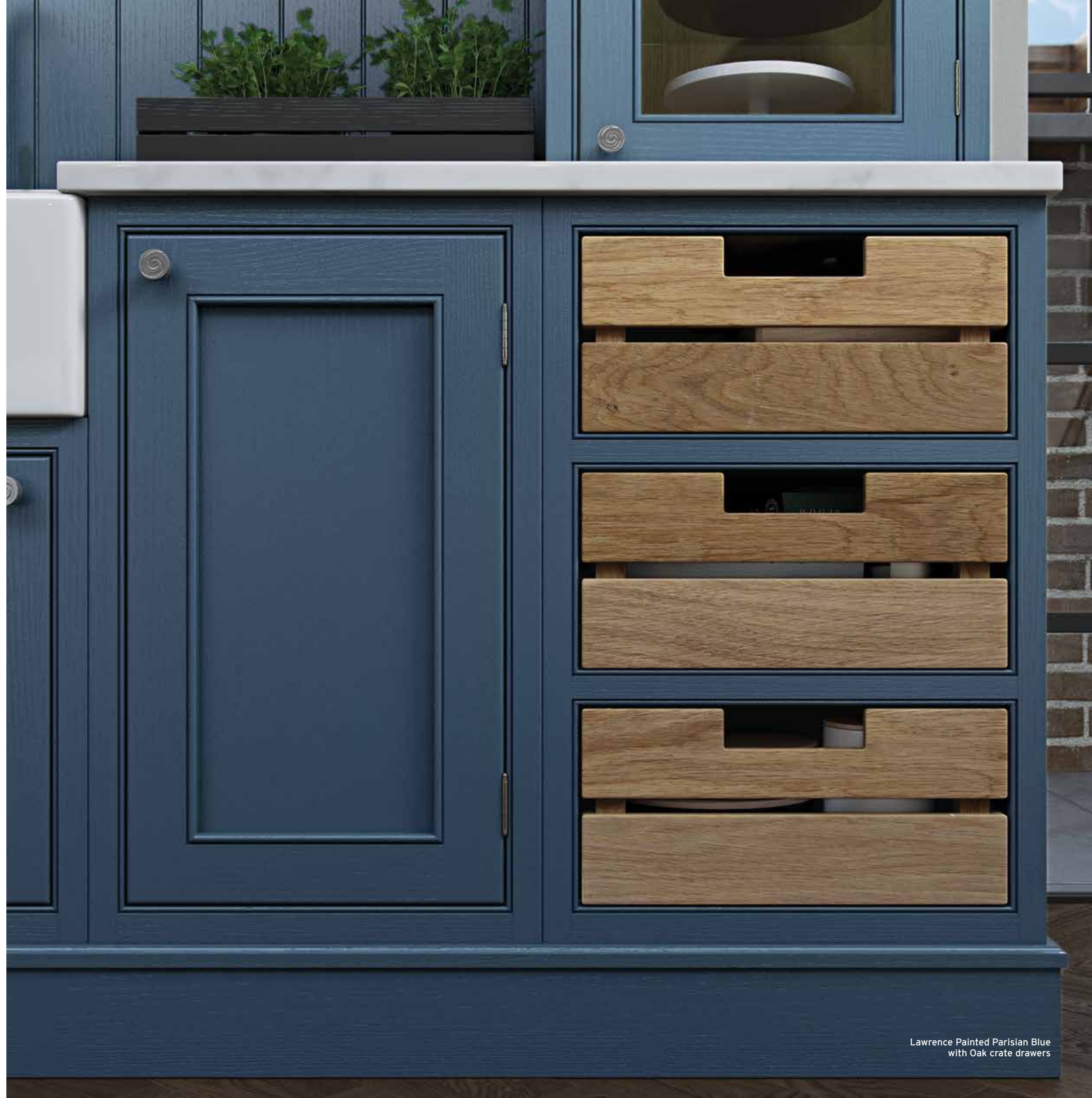
Lawrence Painted Parisian Blue with Oak crate drawers

Finally hinges, catches and handles are applied to provide the ultimate finishing touch.