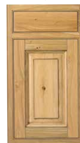
CHARACTER OAK ANTIQUED