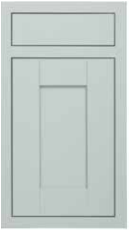
PAINTED LIGHT BLUE