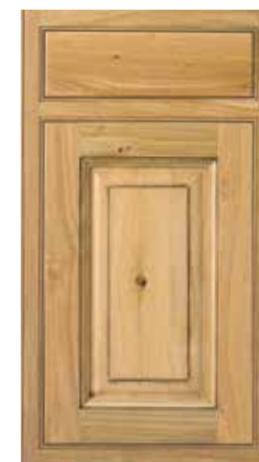
CHARACTER OAK ANTIQUED