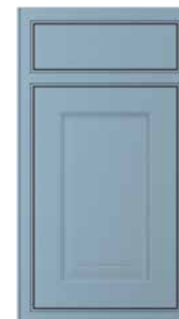
PAINTED SUMMER RAIN