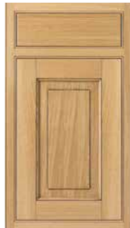
WHITE OAK ANTIQUED

The kitchen shown here features Toronto Painted White Cotton (wall & base units, island) and Light Blue (barrel unit, bench seating).