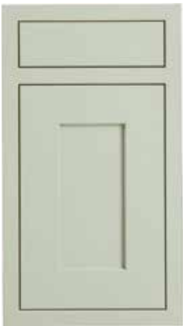
PAINTED SAGE GREEN