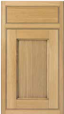
WHITE OAK ANTIQUED