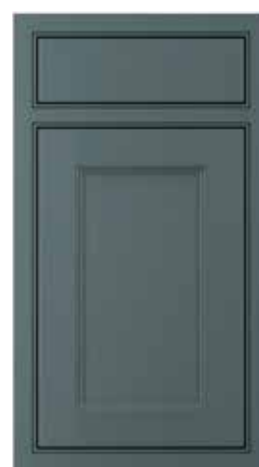
PAINTED GUN METAL GREY

* Any door wider than 400mm is automatically produced as a twin panel door. Sample doors shown above are 400mm wide only and therefore feature a single panel.