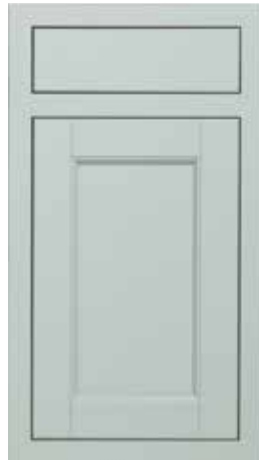
PAINTED LIGHT BLUE