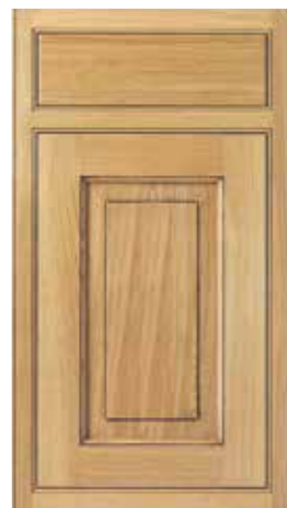
WHITE OAK ANTIQUED

The kitchen shown here features Yorkton Painted Suede (wall & base units, overmantle) with Yorkton Walnut (island, dresser, circular end tables, pull-out trays) and Walnut internal accessories.