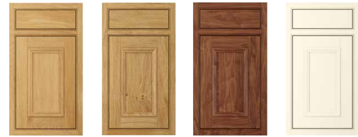
WHITE OAK CHARACTER OAK WALNUT PAINTED SHELL